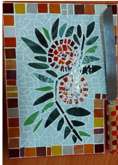
Mosaic Cutting Board by Jill