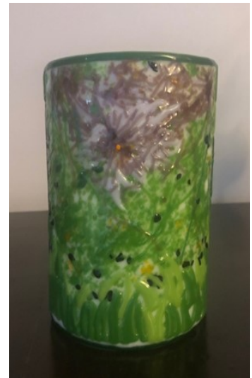
Vase Fused Glass by Rona