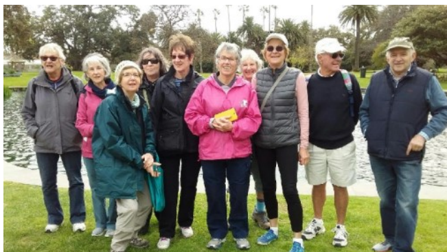
Photo taken on a recent walk to St Kilda Pier.

This comprises a group of like-minded seniors who enjoy coastal and inland one hour walks around bayside, with the reward of a drink at the cafe we have reserved for the group.